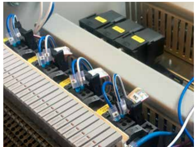
"We've used push-in terminals many times over the years, but these are the fastest and most reliable I've come across, and we will most certainly use Push-In Plus products in future developments."