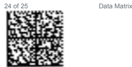
Example 2D (Data Matrix) Barcode