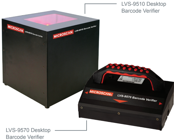
LVS-9510 Desktop Barcode Verifier