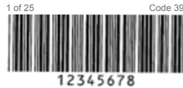
Example 1D (Code 39) Barcode